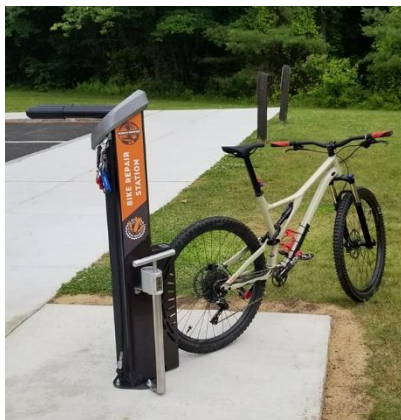
New bike repair stand

This spring the Friends of Wompatuck purchased a bicycle repair stand and in June DCR staff installed it near the Visitor Center. It includes a variety of tools securely attached by retractable braided stainless steel cables and a bicycle pump, so park users can inflate tires and make repairs to their bikes in the parking lot.